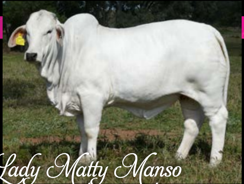
Lady Matty Manso

NOTES: Running with Elrose Jury ELR18749M from 5/7/2022 until sale day.